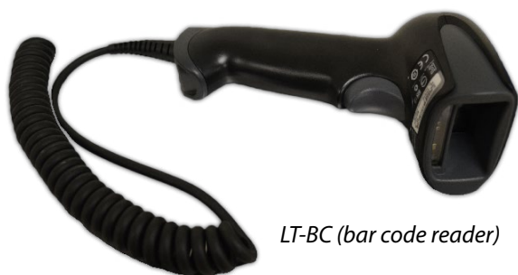
LT-BC (bar code reader)

F0 = 2 Fill or Test Pressures - 2nd Pressure Range - Vacuum F1 = 2 Fill or Test Pressures - 2nd Pressure Range - 0-15 PSIG F2 = 2 Fill or Test Pressures - 2nd Pressure Range - 0-50 PSIG F3 = 2 Fill or Test Pressures - 2nd Pressure Range - 0-100 PSIG TC = 2 Test Pressures, 2 Calibrated Leak Standards VD = Volume Dump (test sealed part) M2 = Dual Manifold